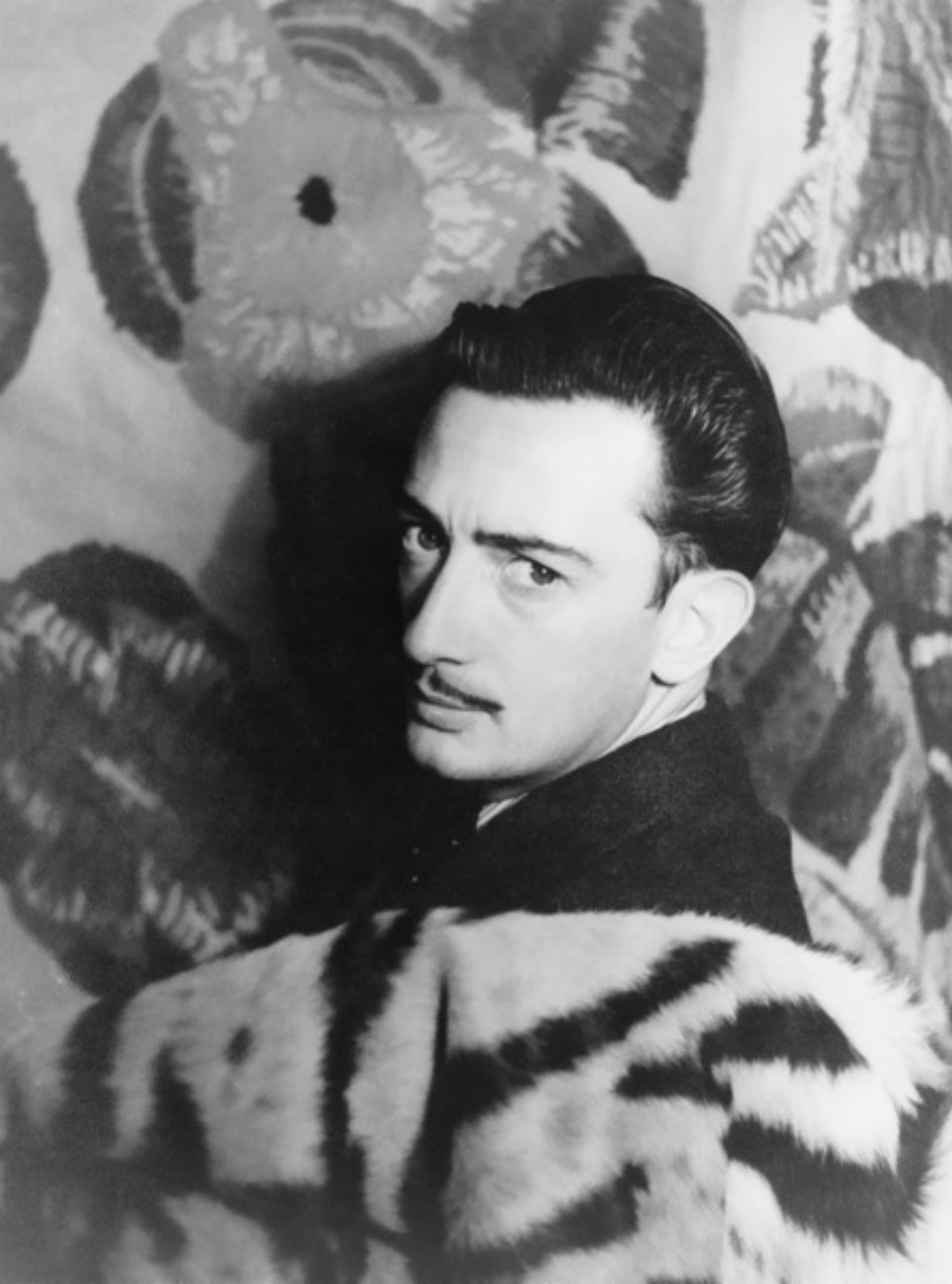
Salvador Dalí (1904-1989)