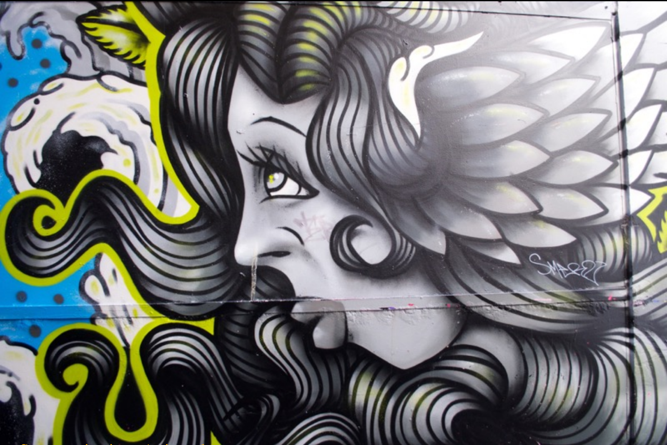
Street art in city – Artist unknown