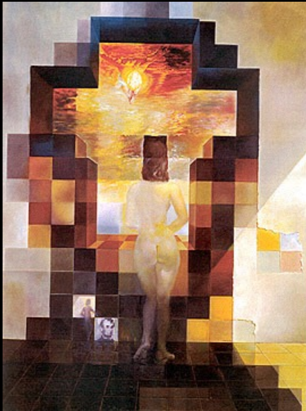
Galea contemplating the mediterranean sea. Dali 1976