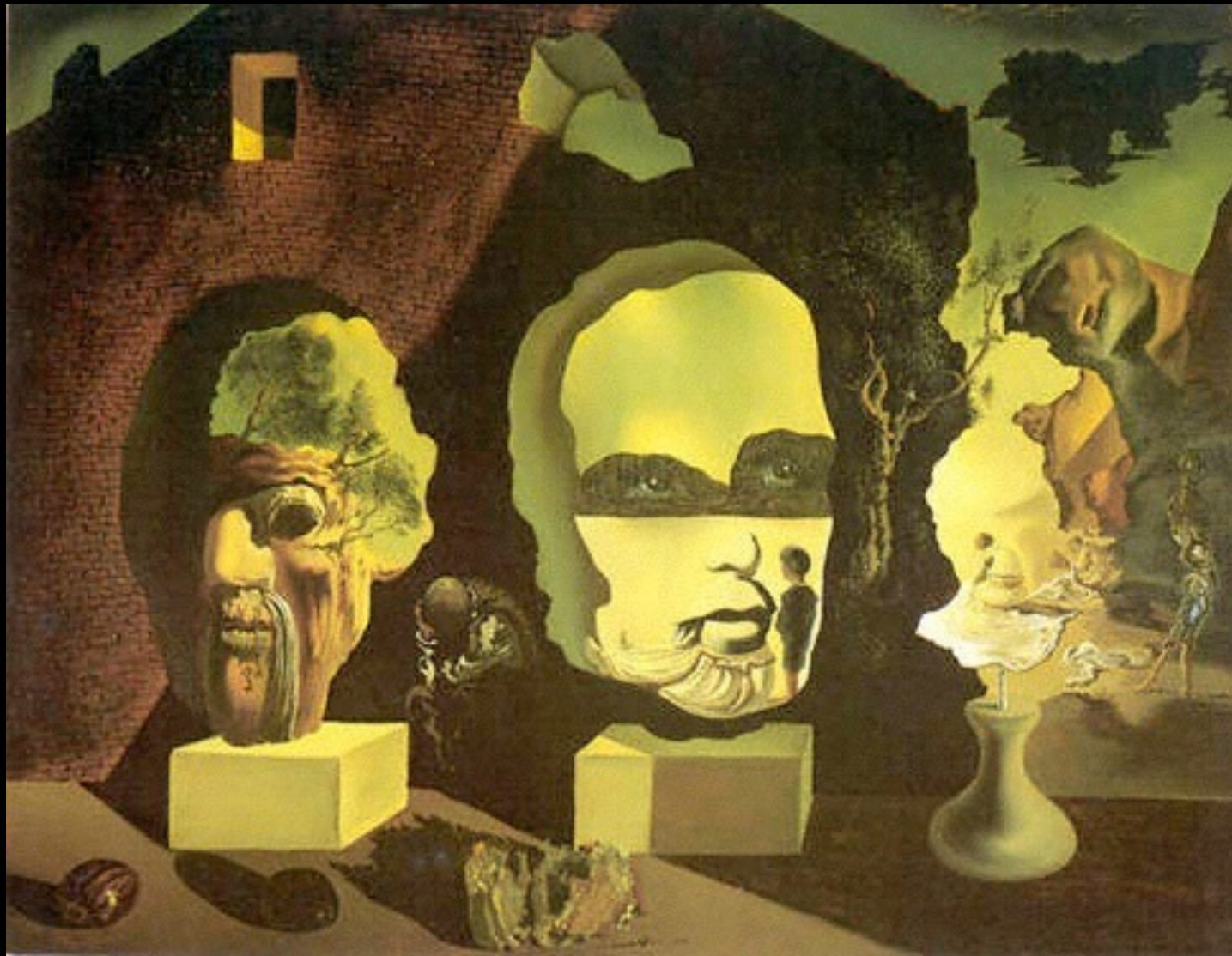
Three Ages of Man, Dali, 1940