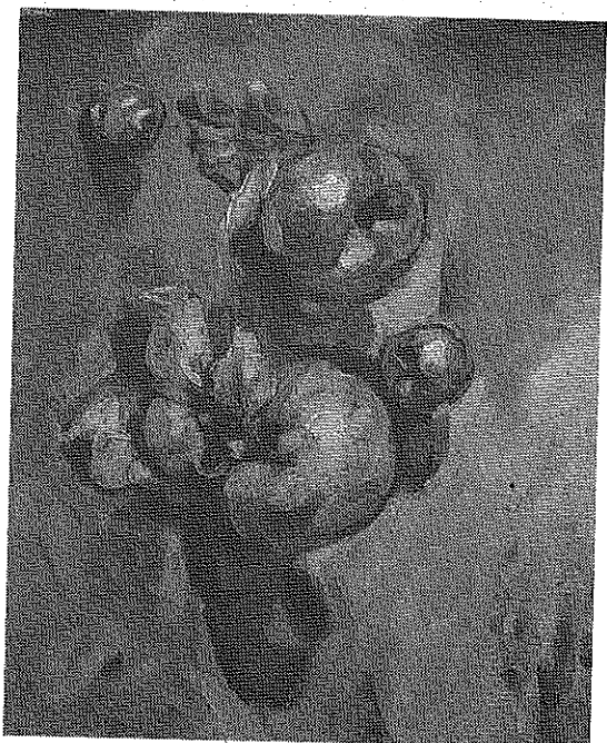
Green Apples, by Paul Cézanne, 1873

Alone together, Pissarro and Cézanne saturated themselves in their own style. Cézanne would methodically copy Pissarro's paintings in order to understand his impressionist technique. "The eye must absorb everything," Pissarro instructed him. "Do not follow rules and principles, but paint what you see and feel. And do not be shy of nature." Cézanne listened to Pissarro. Before long, the burnt umbrellas and mahoganies of Cézanne's early paintings (he loved Courbet) had become the layers of pastel typical of impression-